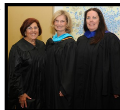
AZS officers prepare for the Initiation Ceremony

Alpha Zeta State would like to extend a warm welcome to our new sisters of Delta Kappa Gamma Society International. At our annual convention this year thirty-four new members were initiated during our state's traditional ceremony. More than twenty of you have had or will have an equally unique initiation experience at your chapter meeting. Whichever event you participated in, we are honored to have you as our new members!