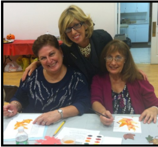
Alpha's watercolor lesson