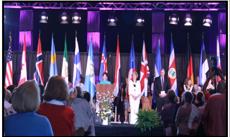
Opening Session of DKG's 2014 International Convention

Nineteen Alpha Zeta State sisters joined with delegates from around the world to attend the 2014 International Convention in Indianapolis. New Jersey's delegates, including seven sisters attending an international convention for the first time, enjoyed five days of outstanding speakers, eye-opening workshops, entertaining presentations, wonderful accommodations, well-run meetings, and renewing and establishing genuine friendships.