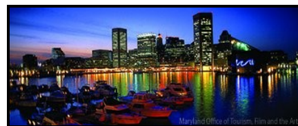
Baltimore, MD --home of the Walters Art Museum and the Inner Harbor's National Aquarium