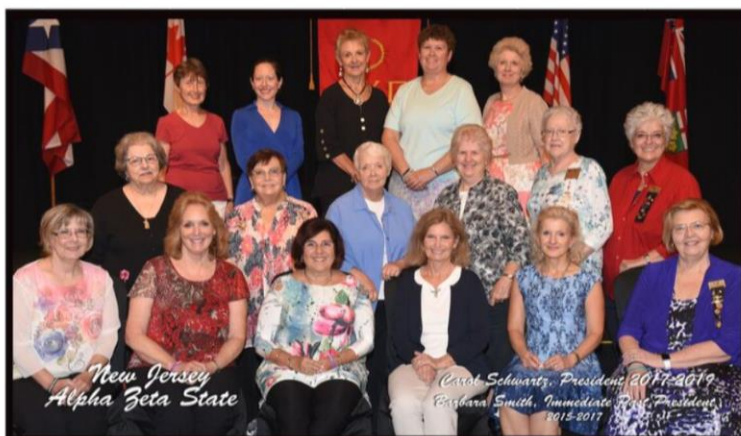
Delta Kappa Gamma 2017 Northeast Regional Conference