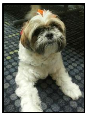
Therapy Dog, Tink.